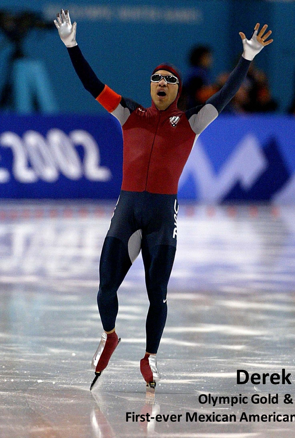
Derek Parra Olympic Gold & First-ever Mexican American