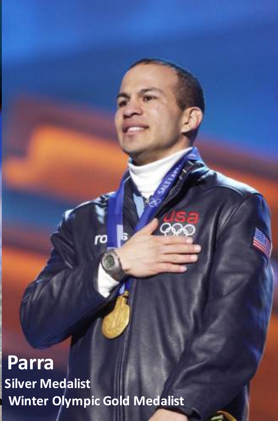
Derek Parra Silver Medalist Winter Olympic Gold Medalist