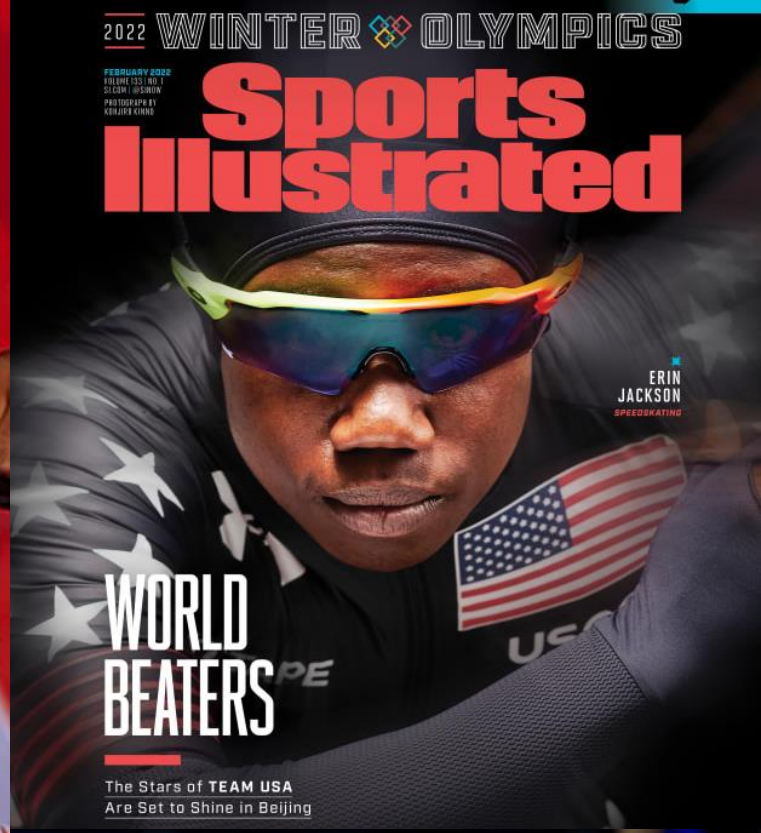
ERIN JACKSON SPEEDSKATING